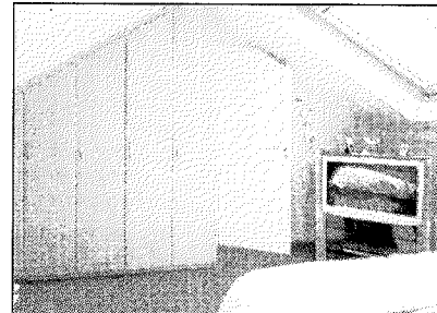
ROOMY: A bright and airy bedroom

The Ranelagh showroom is open from 10am-5pm Mon-Fri and 10am-4pm on Saturdays.